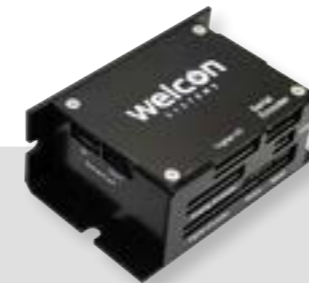
DS-BVM-FCAO / FETC

Closed Loop drive for BLDC and Voice Coil motors CiA 301 Application layer and CiA 402 Device profile for drive and motion control Auto tuning and various parameter setting through DINGS' SERVO STUDIO Supporting CANopen and EtherCAT Position, Speed and Torque control