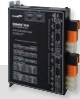
[ A=ABS Encoder / Biss-C type ] DS-CLS9-FETC-2A