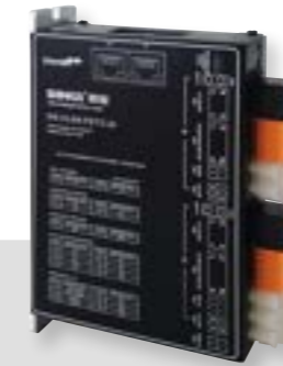
[ I=INC Encoder ] DS-CLS9-FETC-2I

Supports up to 2-axis control Support EtherCAT communication protocol, support control mode PP, PV, HM, PT / PP, PV, HM, CSP, CVS Motor short circuit protection, under-voltage protection, over-voltage protection, over-current protection, etc. Exquisite design, low noise and low vibration Optically isolated inputs