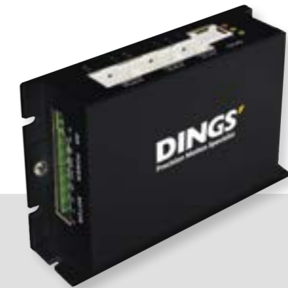
DS-BVS-FCAO / FETC